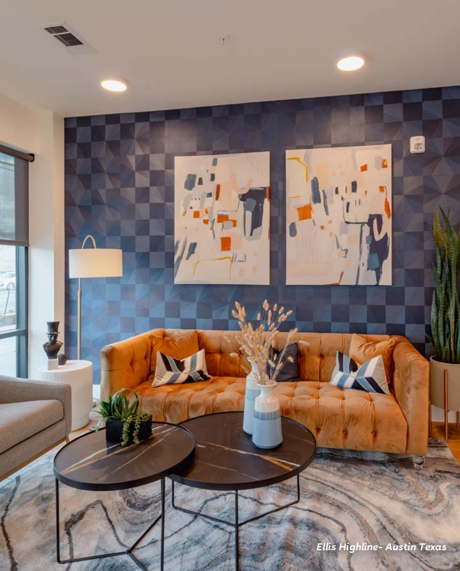
Ellis Highline- Austin Texas