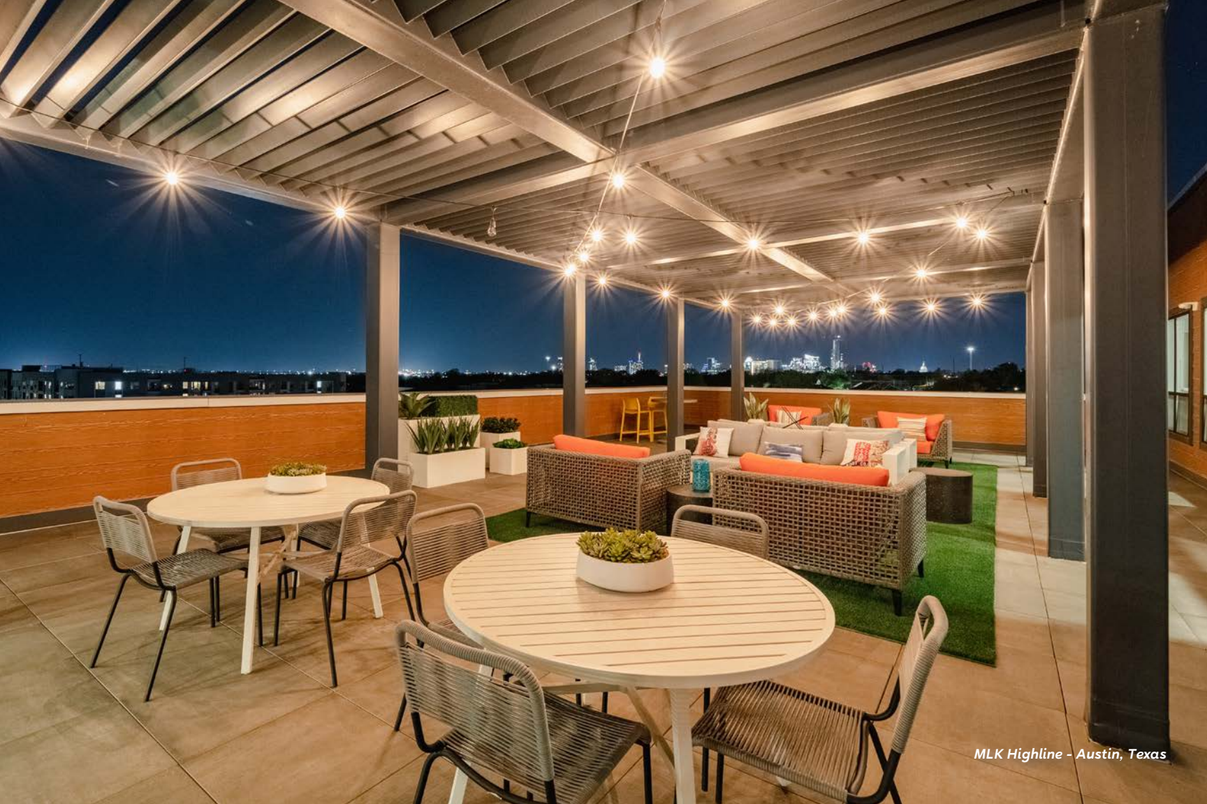
MLK Highline - Austin, Texas