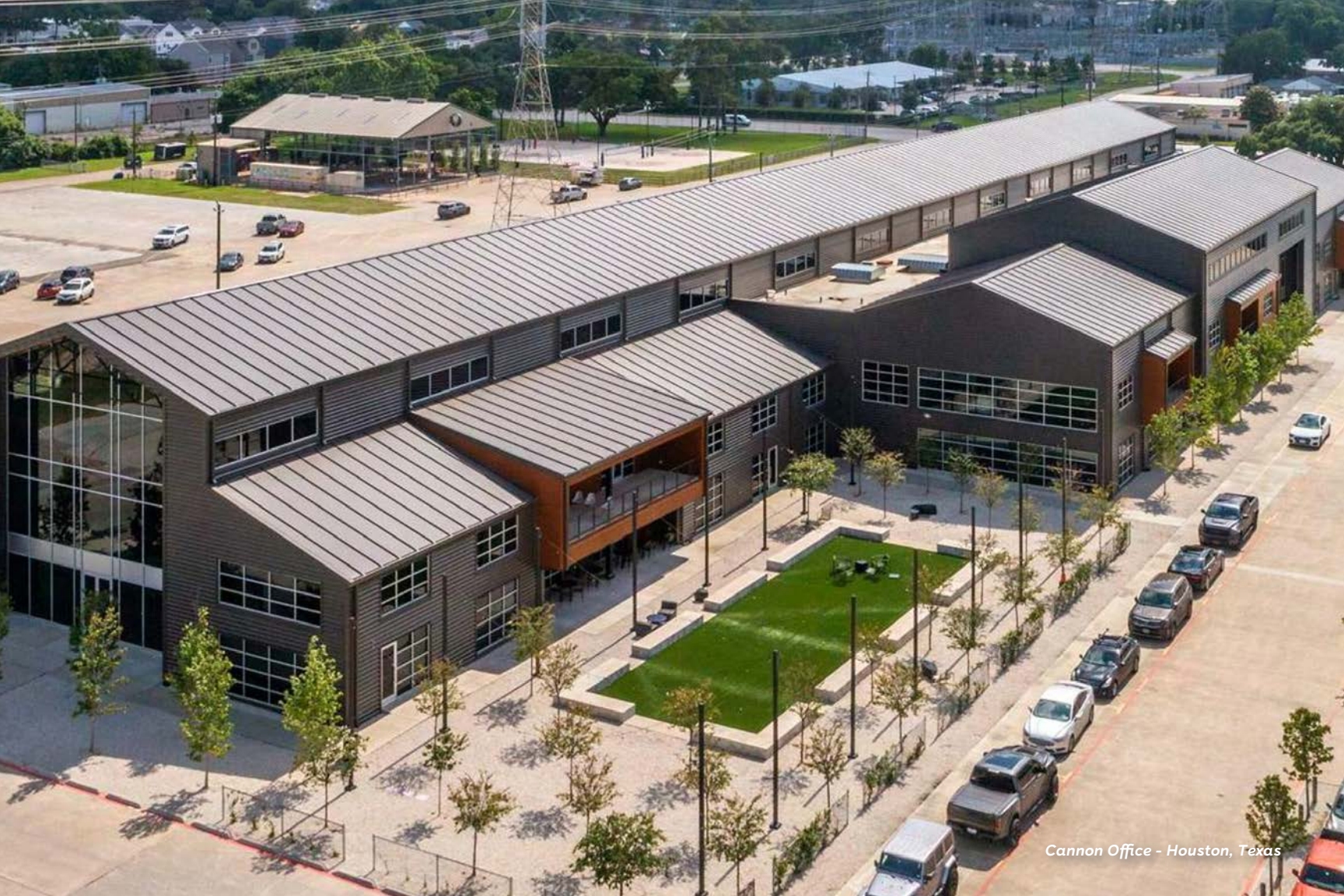
Cannon Office - Houston, Texas