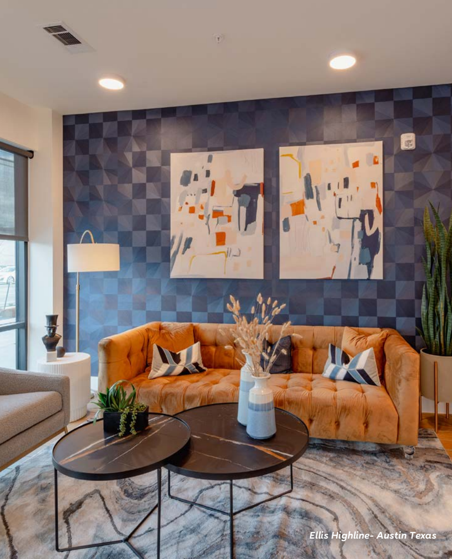
Ellis Highline- Austin Texas