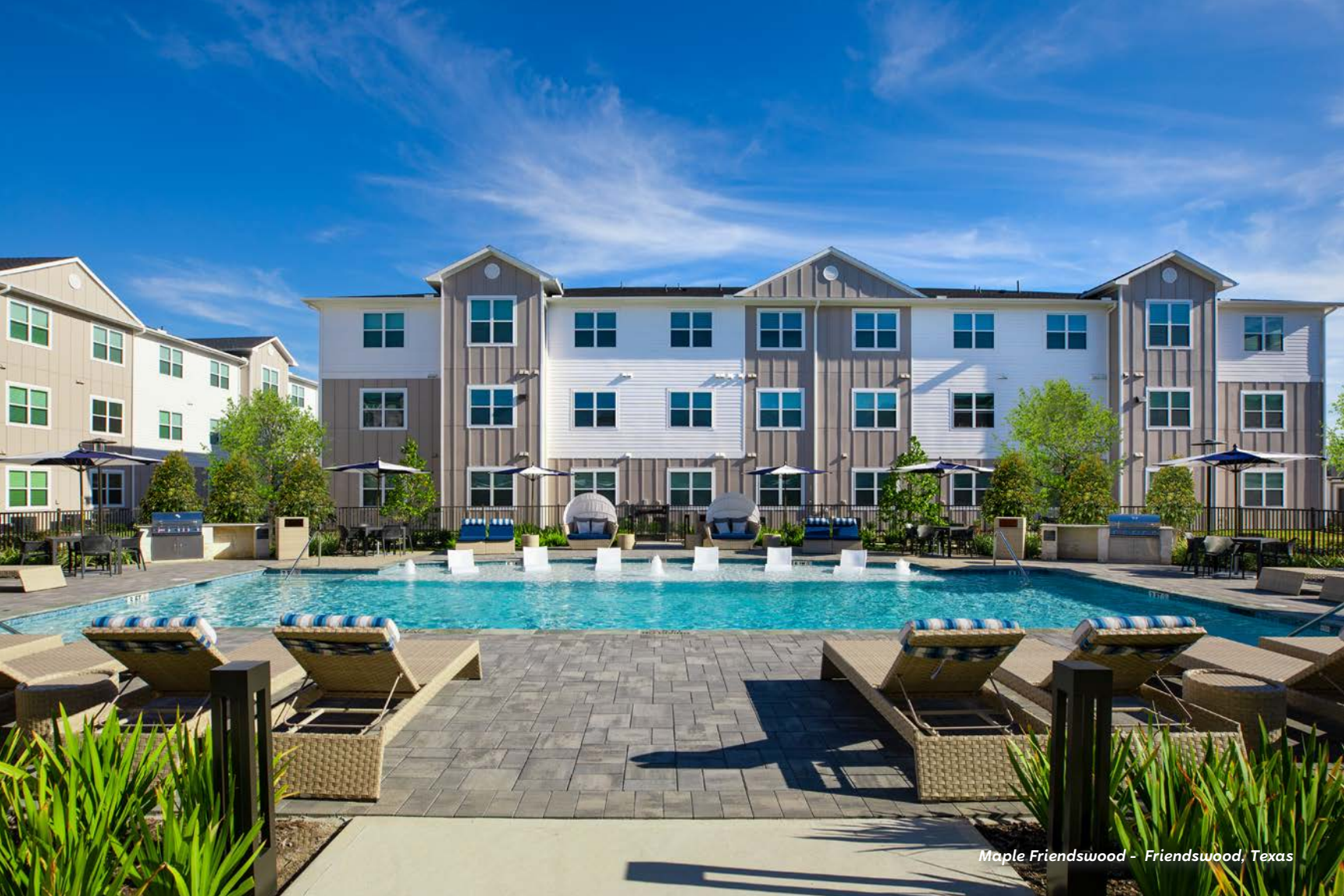
Maple Friendswood - Friendswood, Texas