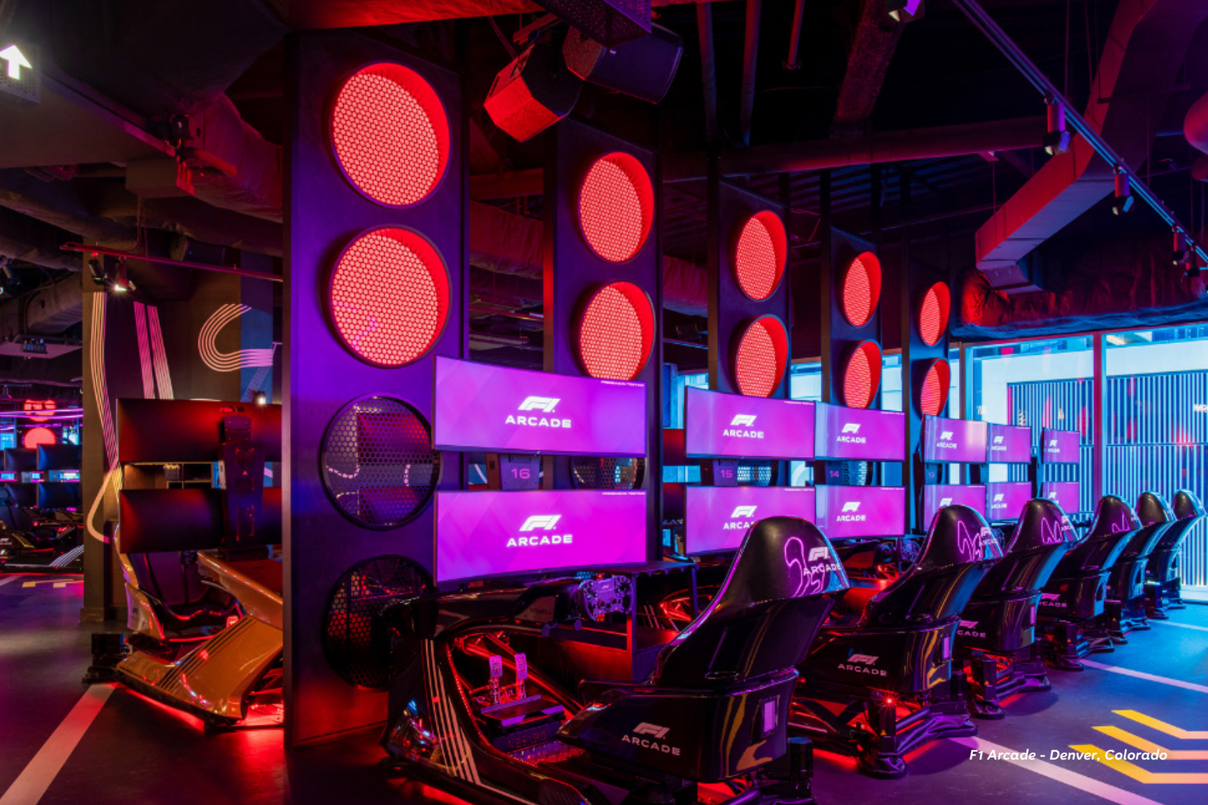
F1 Arcade - Denver, Colorado