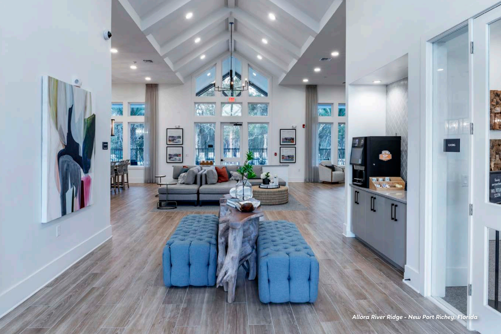
Allora River Ridge - New Port Richey, Florida