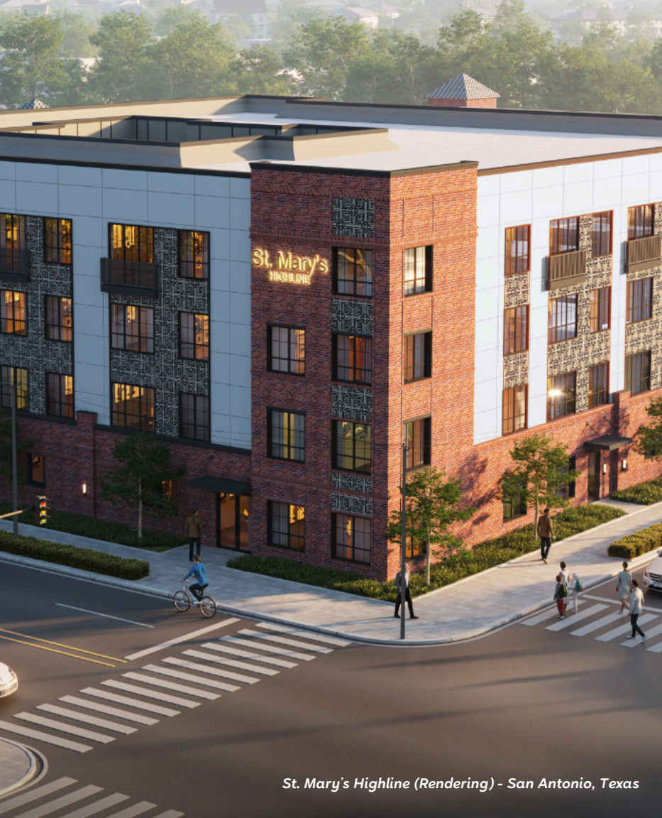
St. Mary's Highline (Rendering) - San Antonio, Texas